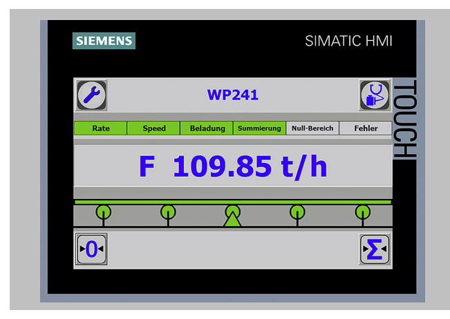
SIWAREX WP241 "Ready-for-use"

In addition to the configuration package, fully-featured SIWAREX WP241 "Ready-for-use" software is also available free-of-charge. It shows beginners how to integrate the module in a STEP 7 program and offers a basis for application programming. This allows you to connect the scale to an operator panel either connected to the SIMATIC CPU or connected directly to the SIWAREX WP241.